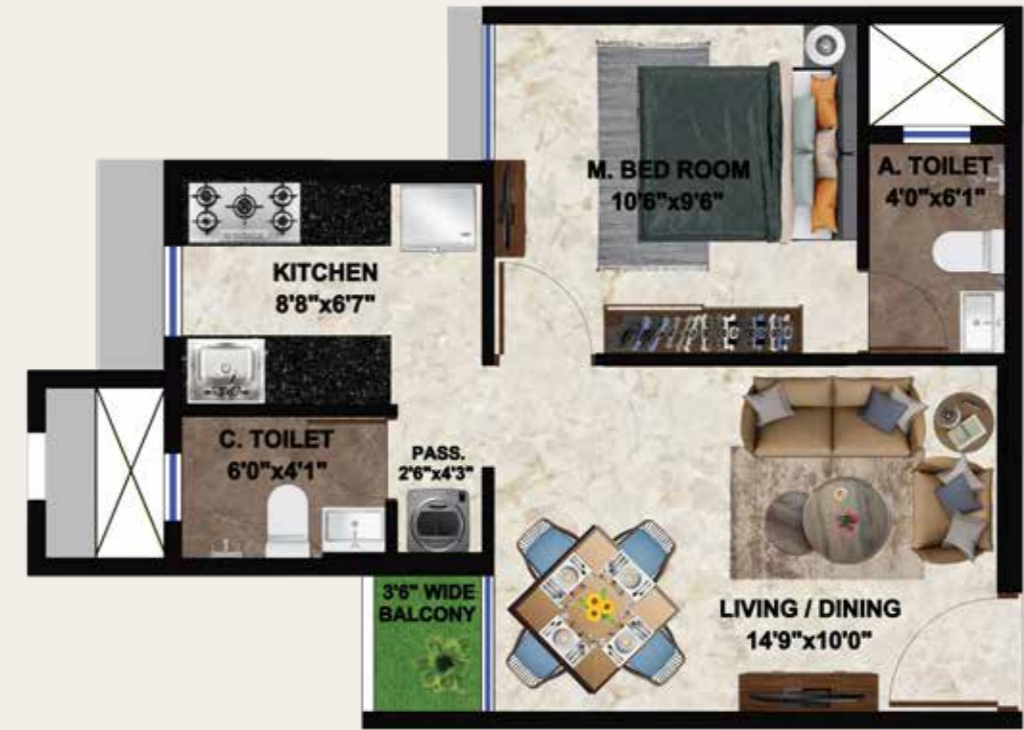
FLAT TYPE - A WING | 1BHK CARPET AREA - 391 SQ.FT.