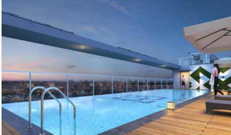
INFINITY SWIMMING POOL

↪ REVOLUTION ↩ IT'S NOT JUST LUXURY IT'S INDULGENCE BEYOND THE TRENDS