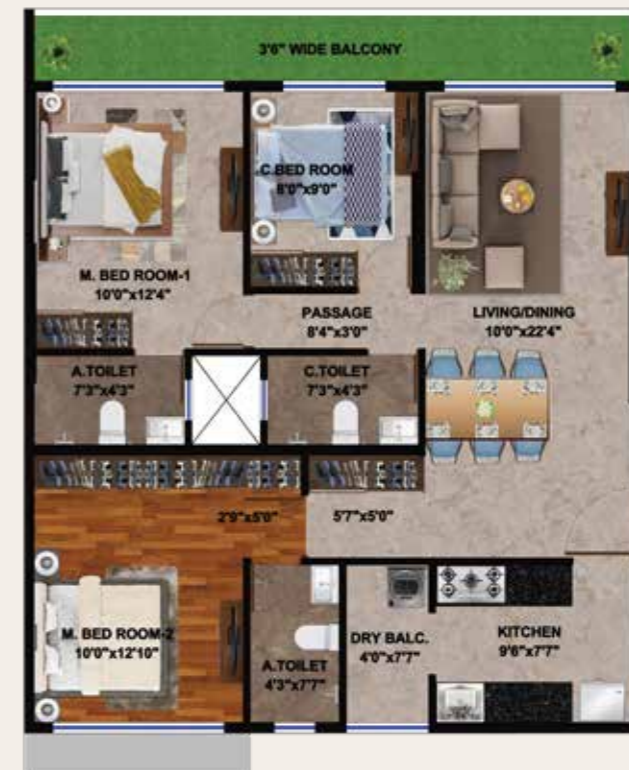
FLAT TYPE - C WING | 3BHK CARPET AREA - 955 SQ.FT.