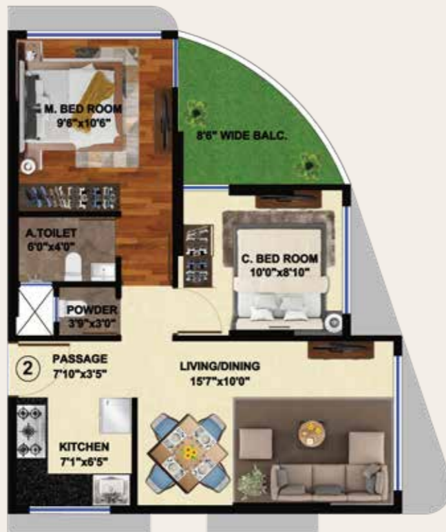
FLAT TYPE - C WING | 2BHK CARPET AREA - 558 SQ.FT.