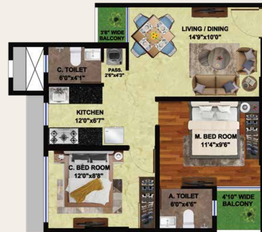
FLAT TYPE - A WING | 2BHK CARPET AREA - 564 SQ.FT.